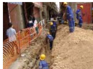
Essential services provided to almost 90,000 informal settlements in the Greater Casablanca region