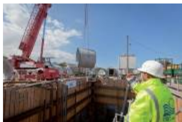
East Coast Anti-Pollution System , new large-scale plant offering 100% pollution control

One of the solutions implemented in Casablanca is AQUADVANCED™, which offers smart management of water distribution networks and, in so doing, ensures better visibility of the network and early detection of anomalies.