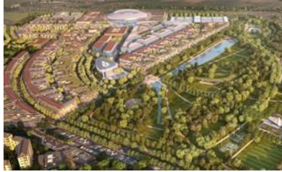
Masterplan of the future district ©Milano Santa Giulia