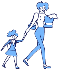
A child walking with a parent