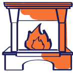
Smoke coming out of a chimney